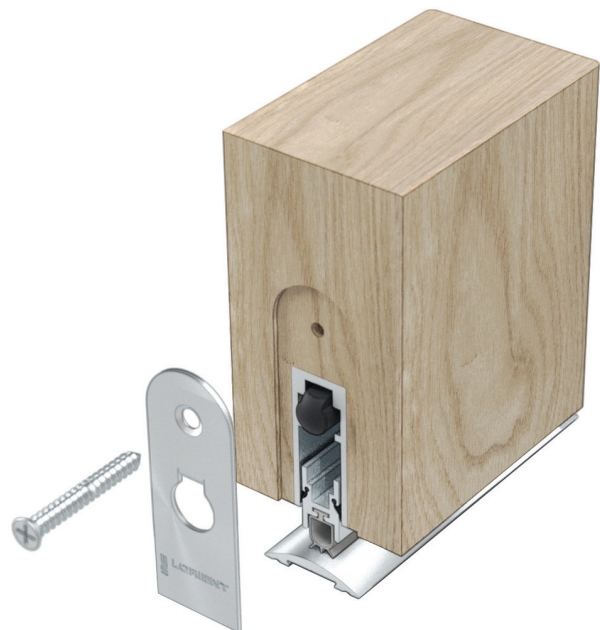
LAS8001 si (shown with LAS4001)